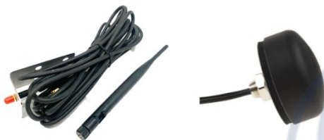
Optional Outdoor LTE-M wall-mount antenna (ANT100200100)